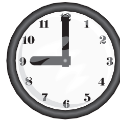
This clock tells time.