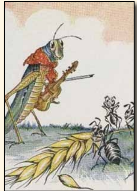
The Grasshopper and the Ants