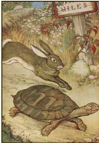
The Tortoise and the Hare